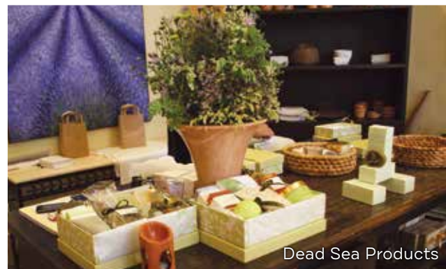
Dead Sea Products

No trip to the Dead Sea is complete without a visit to one of the many outlets that sell the world-famous Dead Sea products. These products are reasonably-priced, of excellent quality, and make great gifts. There are also many shops selling Jordanian handicrafts, rugs, Bedouin jewelry, mosaics, sand bottles, glassware and other locally-made items.