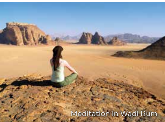
Meditation in Wadi Rum