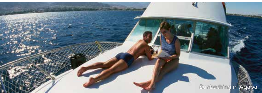
Sunbathing in Aqaba