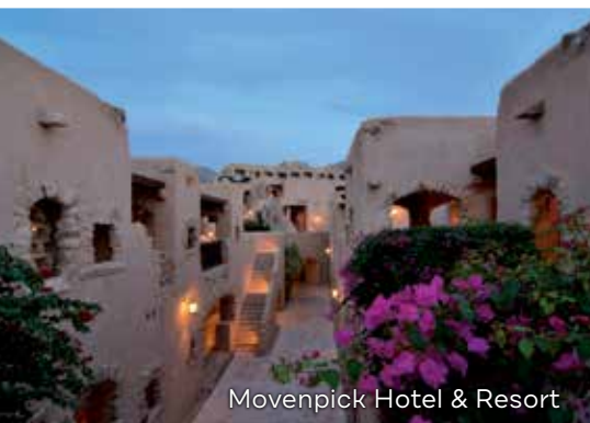
Movenpick Hotel & Resort

Dead Sea therapies are so highly regarded by some EU countries, including Germany and Austria, that long stays in the area are available courtesy of their health insurance plans.