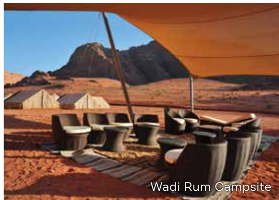
Wadi Rum Campsite