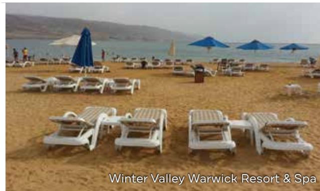
Winter Valley Warwick Resort & Spa