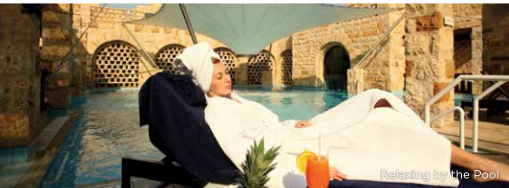
Relaxing by the Pool

Another way to relieve stress at the Dead Sea is by joining one of the newly founded yoga and meditation groups that use the area's natural beauty and serenity to reach unrivaled levels of relaxation. Meditation, a new dimension to the unique Jordanian tourism product catalogue, brings peace to the heart & mind and promotes youth, wellbeing and health.