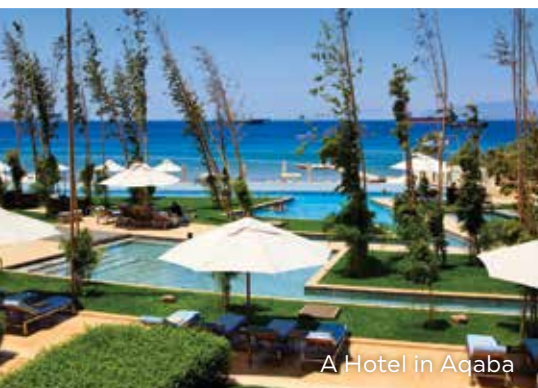
A Hotel in Aqaba