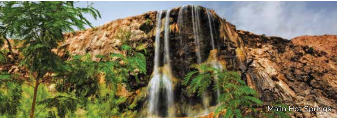
Ma'in Hot Springs