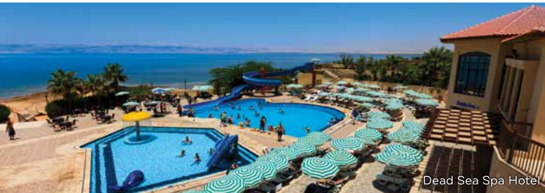
Dead Sea Spa Hotel