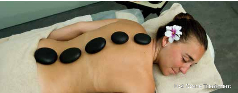
Hot Stone Treatment