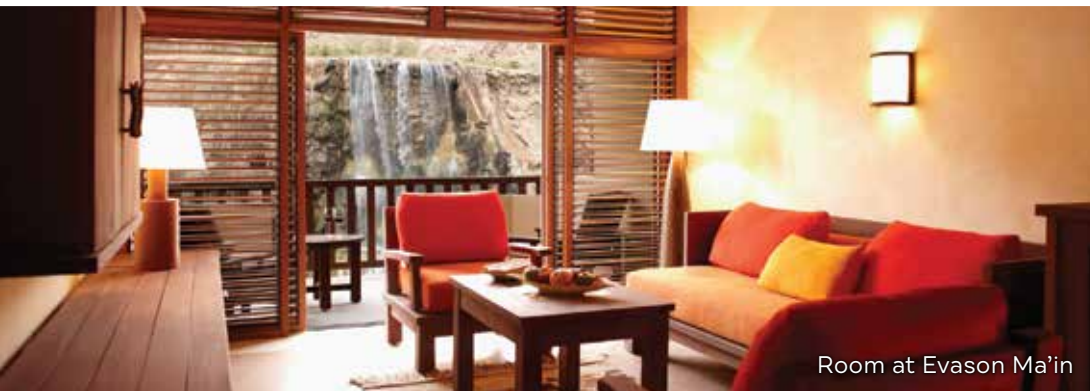
Room at Evason Ma'in