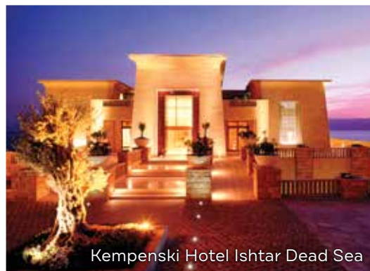
Kempinski Hotel Ishtar Dead Sea