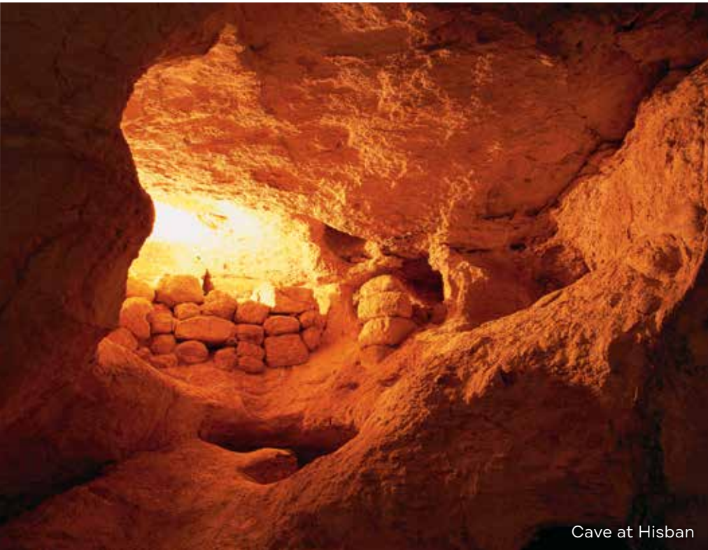
Cave at Hisban