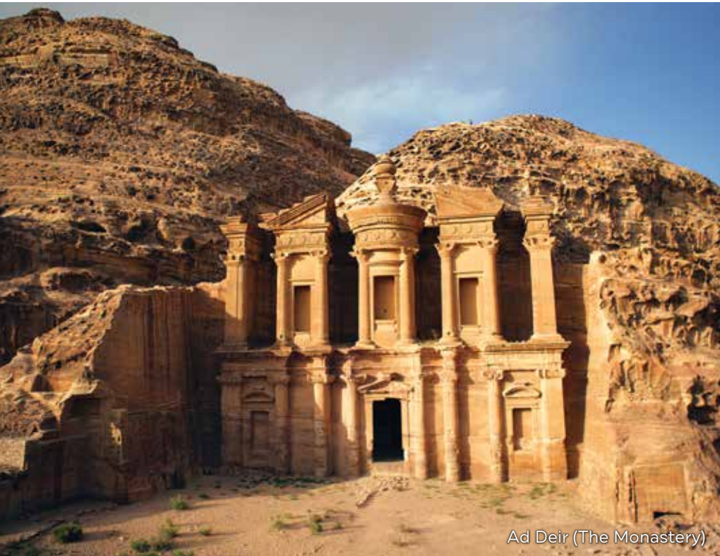
Ad Deir (The Monastery)

Islamic shrine/tomb, were built on the summit of the mountain, which today attracts pilgrims from all over the world. Aaron is best remembered for the beautiful blessing that God commanded him to give people: