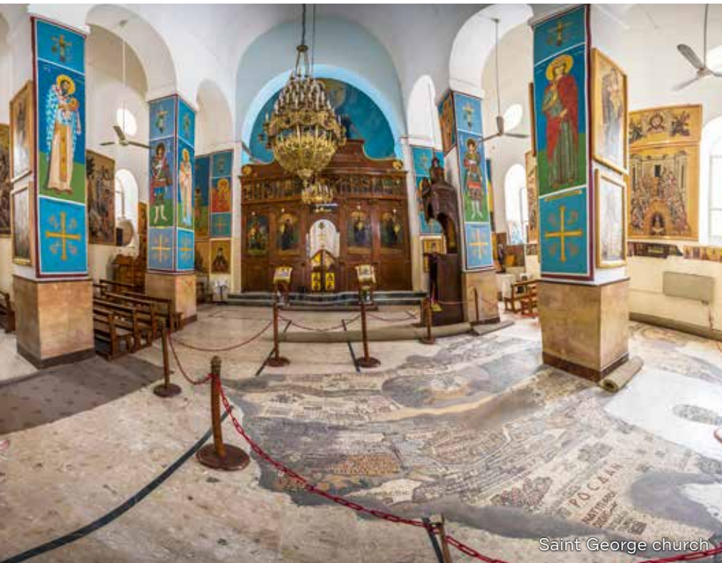
Saint George church

But Madaba's real masterpiece, located in the Orthodox Church of Saint George, is the 6th century AD mosaic map of Jerusalem and the Holy Land – the earliest religious map of the Holy Land in any form to survive from antiquity. Accordingly, Madaba is dubbed “The City of Mosaics”.