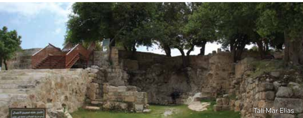
Tall Mar Elias