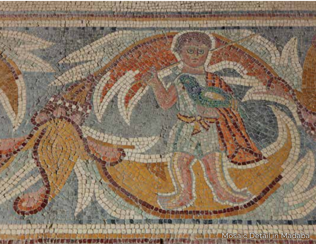
Mosaic Detail in Madaba

Known in the Old Testament as Medeba, Madaba and its hinterlands are located in central Jordan. These lands were featured in narratives related to Moses and the Exodus, David's war against the Moabites, Isaiah's oracle against Moab, and King Mesha of Moab's rebellion against Israel.