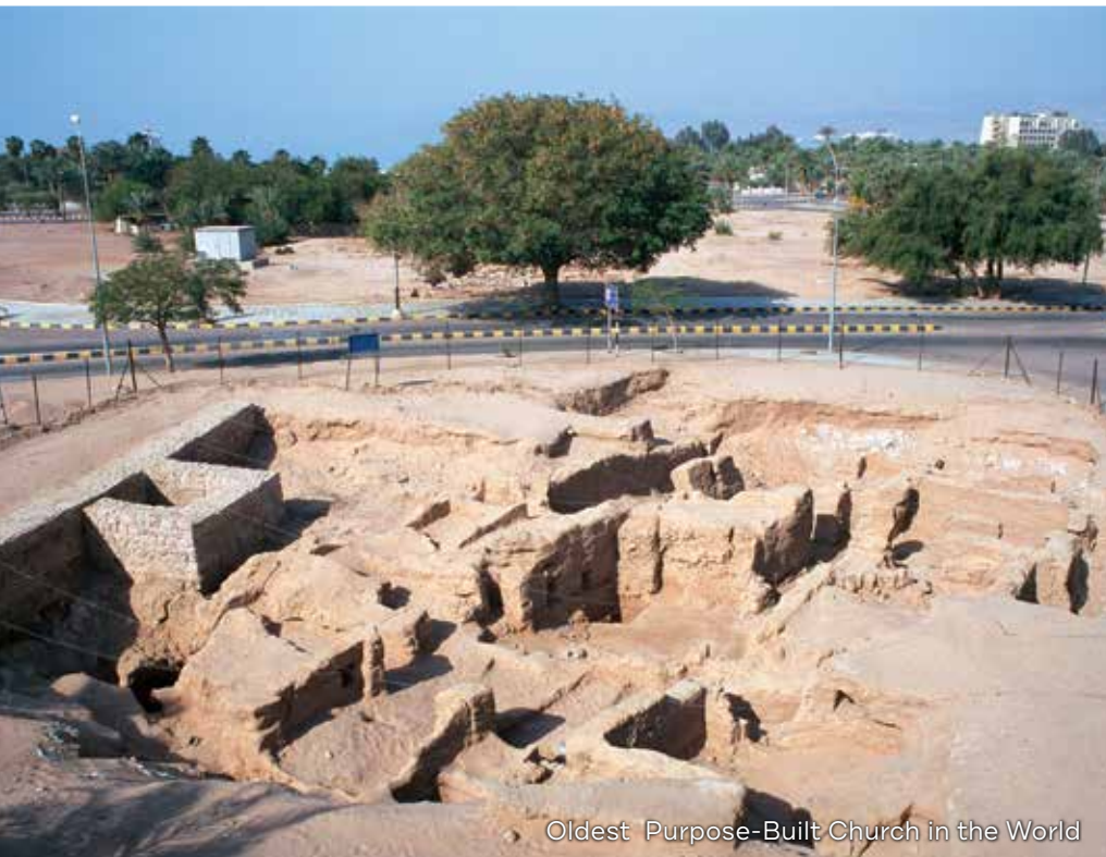
Oldest Purpose-Built Church in the World